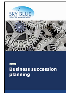
Business succession planning