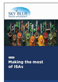
Making the most of ISAs

Call us now for further information or advice