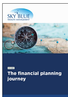
The financial planning journey