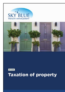
Taxation of property